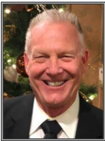
1 st Vice Pres. - Activities