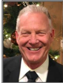
1 st Vice Pres. - Activities