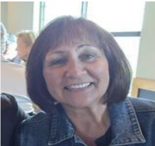
Pontiac Club of Central California (judges cars)