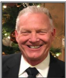
1 st Vice Pres. - Activities