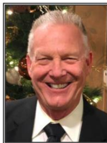
1 st Vice Pres. - Activities