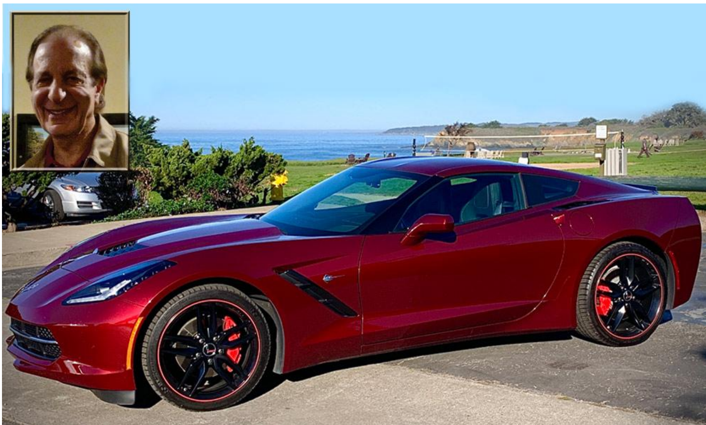
2016 Long Beach Metallic Red Coupe