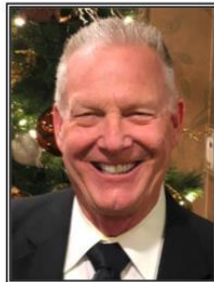
1 st Vice Pres. - Activities