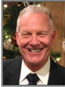
1 st Vice Pres. - Activities