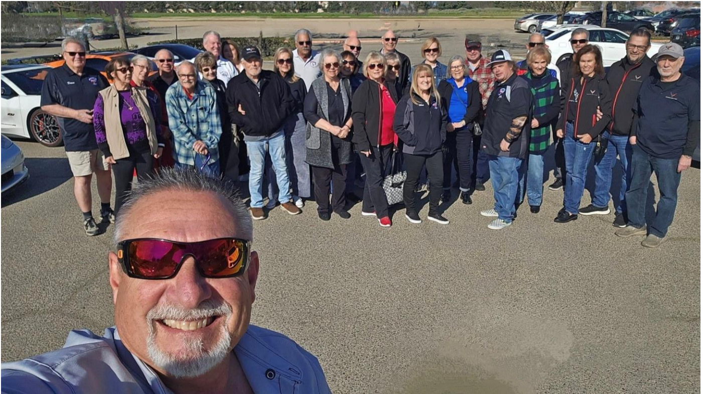
Ice Breaker Run Jan.24, 2025